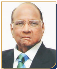
SHRI. SHARAD PAWAR Hon. President